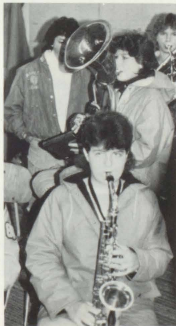
Another fun day in band.

This year marching band got off to an early start with band camp held at the school in early August. The camp culminated with the first out-of-state trip by the Ashley Marching Band. They accepted an invitation to perform at Cedar Point in Ohio. After an outstanding performance on the midway, the band had the rest of the day to enjoy the amusement park. The marching band also performed in the Marion Springs Country Happenin's Days Parade before the beginning of the school year. In addition to fine marching performances at all the home football games, the band marched at the Clinton County Marching Festival. The band, once again, had the crowd on its feet with another standing ovation performance.